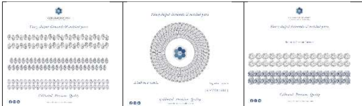
Precisely cut diamonds in calibrated sizes from Vivid Collection DMCC

Buyers looking for calibrated diamonds – from pairs and layouts to rows upon rows of matching stones – are encouraged to visit Vivid Collection DMCC at the fair. A manufacturer of “Thai Cut Diamonds,” the supplier offers stones in rounds and virtually all fancy shapes, including emeralds, Asschers, baguettes, tapers, princess, marquise, pears and ovals, among others.